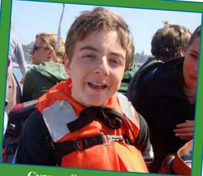
Cypress Summer Intensive Program/Camp Petaluma Community activities including kayaking, swimming and numerous field trips for children with autism and other disabilities.