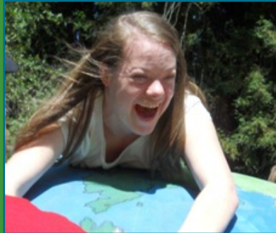
Valley of the Moon Camp Glen Ellen Overnight camp including outdoor games, swimming, music, and campfire activities for adults.