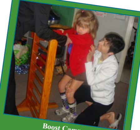
Boost Camp Santa Rosa Four-week intensive movement education program for children with cerebral palsy.