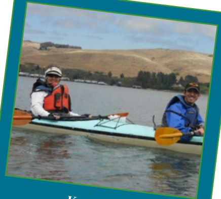
Kayak Trips Tomales Bay Seasonal trips for children and adults led by Environmental Traveling Companions.