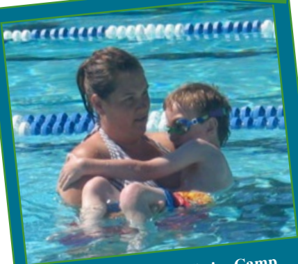
Sidekicks Summer Swim Camp Sonoma State University, Rohnert Park Five-day camp at SSU pool for school-aged children with disabilities.